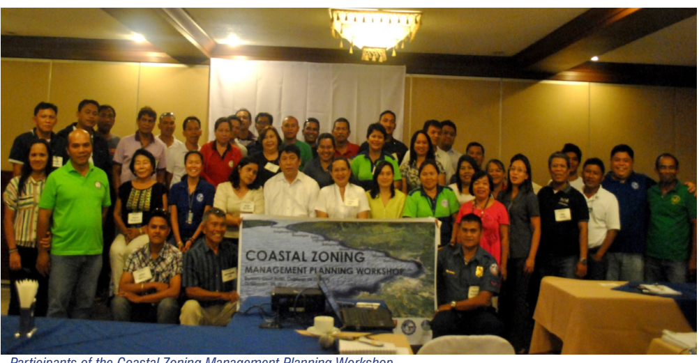
Participants of the Coastal Zoning Management Planning Workshop